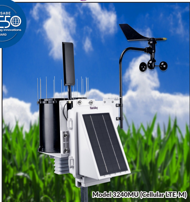
Model 3240MU (Cellular LTE-M)